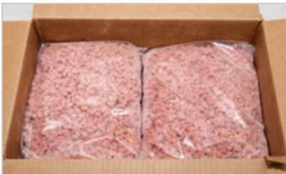
Back-of-house product packaging