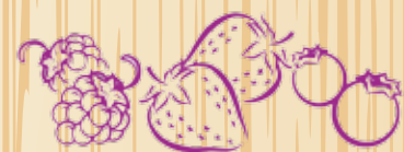
Triple Berry Crunch

The Father's Table ® Donating 50% of Profits to Charity