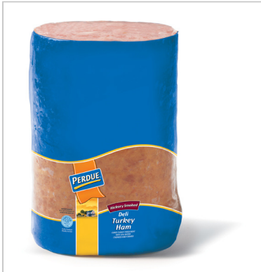
Back-of-house product packaging