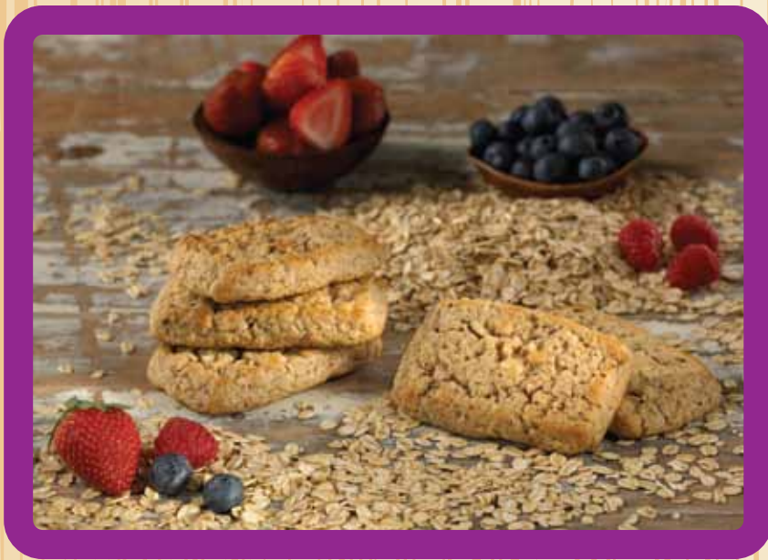
Triple Berry Crunch

The Father's Table ® Donating 50% of Profits to Charity