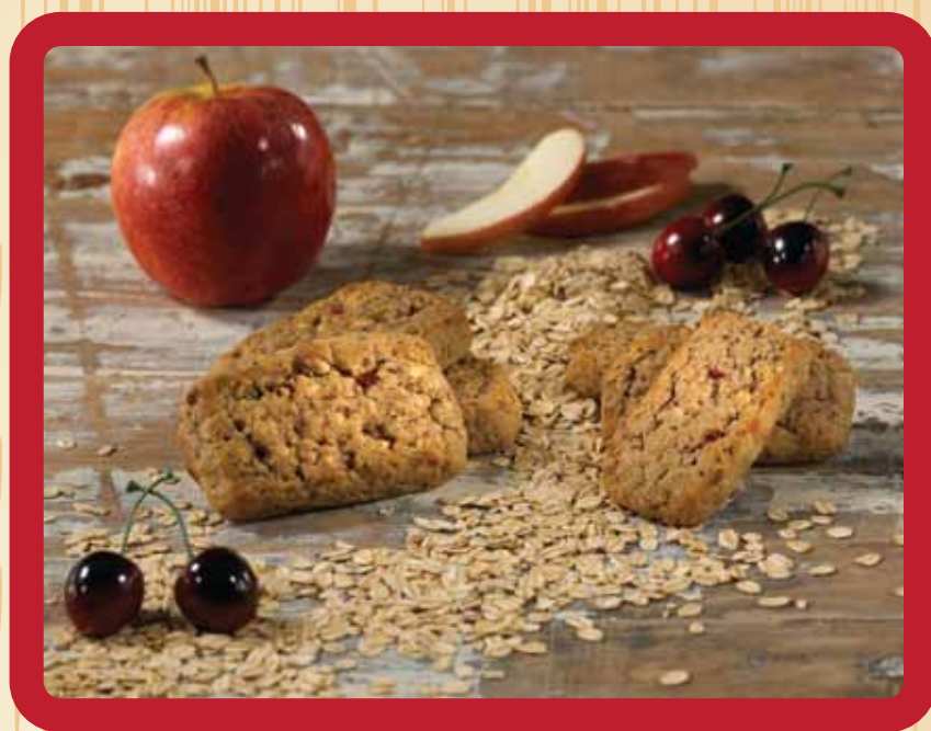
Cherry Apple Crunch