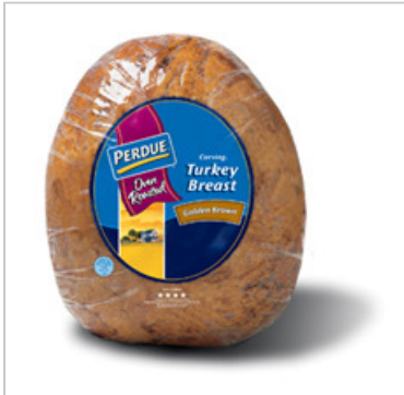
Back-of-house product packaging