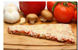
Whole Wheat Wedge Cheese Product# 96WWED75