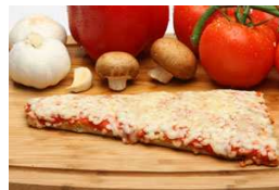
Whole Wheat Wedge Cheese Product# 96WWED15