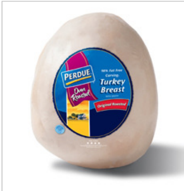
Back-of-house product packaging